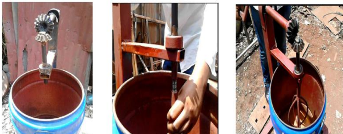
Figure 3: Engaging and removing chemical mixer part (Photo shoot by Author).

As indicated in Figure 2, the fabricated manual Textile Chemical processing machine can mix chemical solution by rotating machine handle by hand. The machine can mix the solution uniformly. After chemical solution preparation, the machine mixer can be removed and textile material can be impregnated into the solution for further processing.