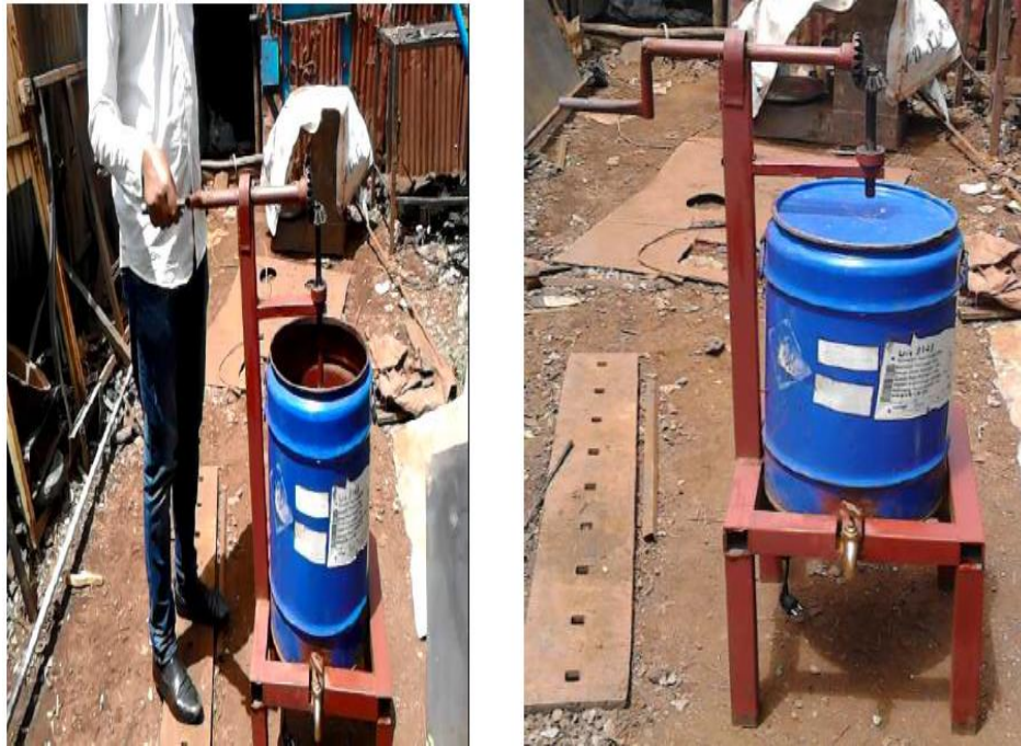
Figure 2: Fabricated Manual Textile chemical mixing and processing machine

As indicated in Figure 2, the fabricated manual Textile Chemical processing machine can mix chemical solution by rotating machine handle by hand. The machine can mix the solution uniformly. After chemical solution preparation, the machine mixer can be removed and textile material can be impregnated into the solution for further processing.